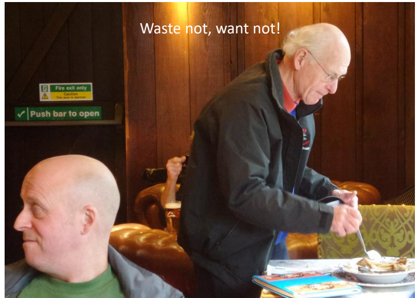
Waste not, want not!