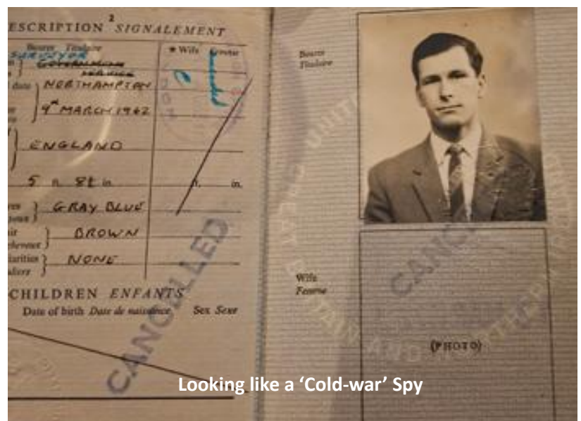
Looking like a 'Cold-war' Spy

After numerous other delights and adventures in the Nigerian swamps, the deserts of Saudi Arabia, Ethiopia and being violently seasick whilst endeavouring to work in hurricanes in the North Sea, I was incredibly grateful indeed to come to Qatar which I find is paradise.